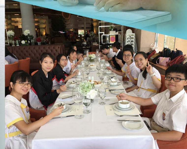
Table etiquette workshop

Why English? English is more than just the most commonly spoken language on our planet. It opens opportunities for our students and makes them more desirable as employees. It is a must for our students who wish to attend university as well as many other post-secondary education programmes. Its home to some of the greatest literature in the world and allows you to communicate internationally. It also allows you to gain access not only to world-wide pop cultures but also puts the world's knowledge right at your fingertips. At Buddhist Leung Chik Wai College, we not only recognize this but embrace it. From drama to debates, from English weeks to our enhancement courses there are no shortage of opportunities for our students to participate in the English Language. Beyond our Primary 6 Interview Activity we also hold English Sharing on a regular basis during our assemblies. We have fashion shows, games and activities for students at lunchtime and also participate in both the Choral and Solo Speaking in the Hong Kong Schools Speech Festival. There are ample opportunities for your sons and daughters to practise, improve and enjoy English at our school!